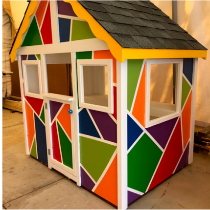
Materials donated by B&C ACE Home & Garden Center.