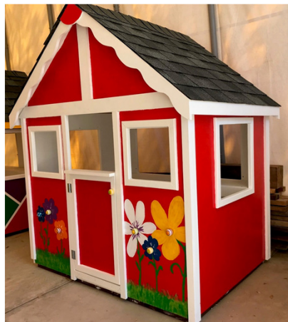
Materials donated by B&C ACE Home & Garden Center.